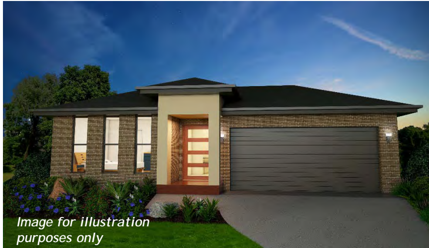
Image for illustration purposes only