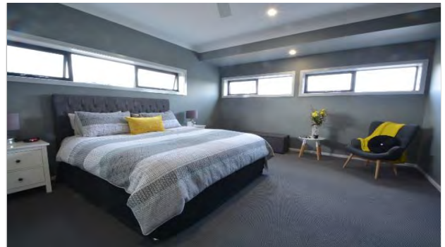
Unique design - can be tailored to your taste