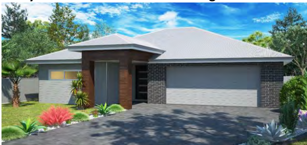
Optional - PROJECT Facade