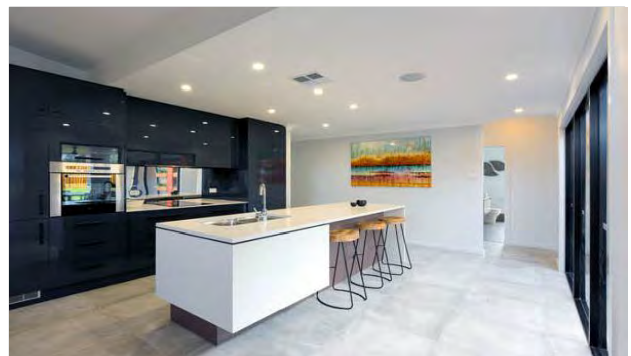
Martin provide in-house Kitchen, Bathroom & Laundry design