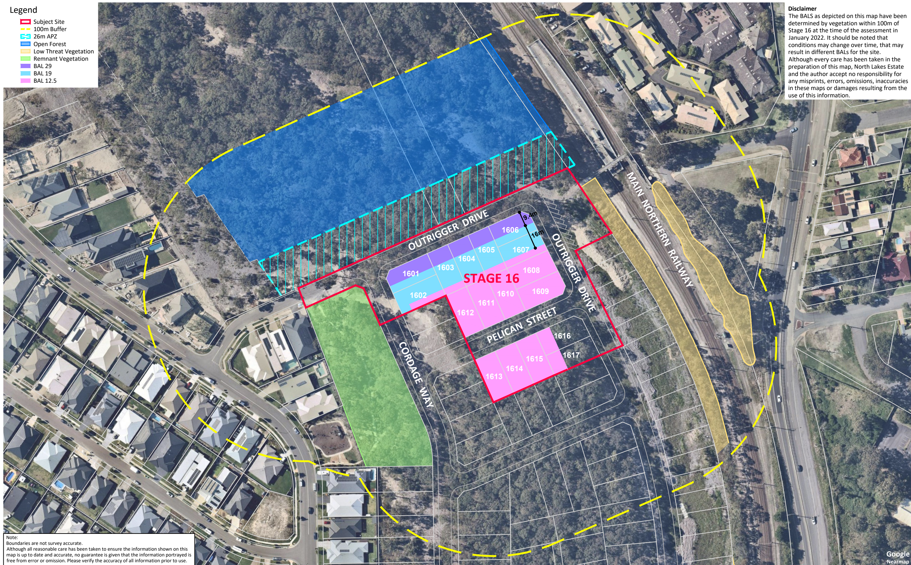
FIGURE 5-1: BUSHFIRE ATTACK LEVELS

Disclaimer The BALS as depicted on this map have been determined by vegetation within 100m of Stage 16 at the time of the assessment in January 2022. It should be noted that conditions may change over time, that may result in different BALS for the site. Although every care has been taken in the preparation of this map, North Lakes Estate and the author accept no responsibility for any misprints, errors, omissions, inaccuracies in these maps or damages resulting from the use of this information.