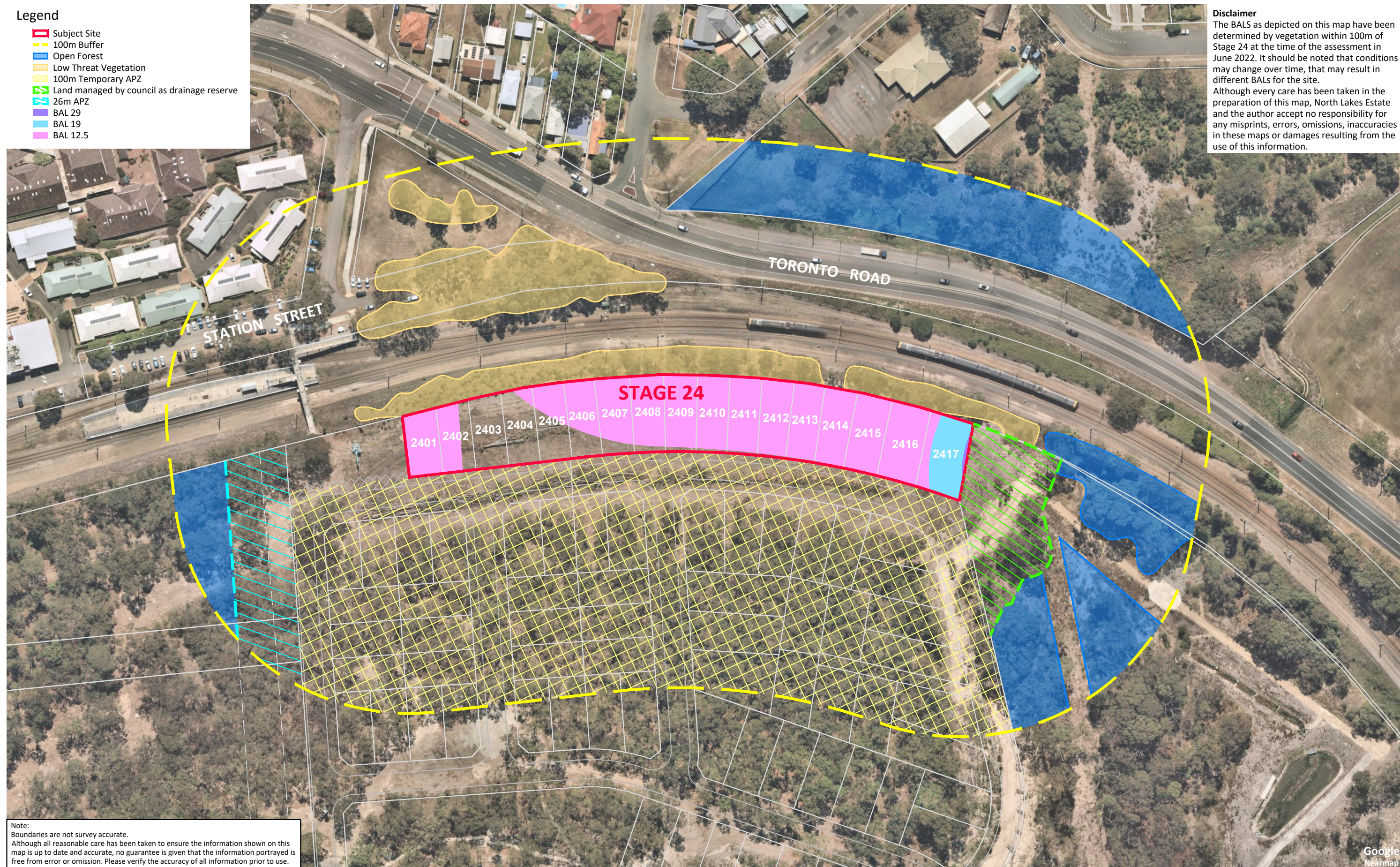
FIGURE 5-1: BUSHFIRE ATTACK LEVELS

Disclaimer The BALS as depicted on this map have been determined by vegetation within 100m of Stage 24 at the time of the assessment in June 2022. It should be noted that conditions may change over time, that may result in different BALS for the site. Although every care has been taken in the preparation of this map, North Lakes Estate and the author accept no responsibility for any misprints, errors, omissions, inaccuracies in these maps or damages resulting from the use of this information.