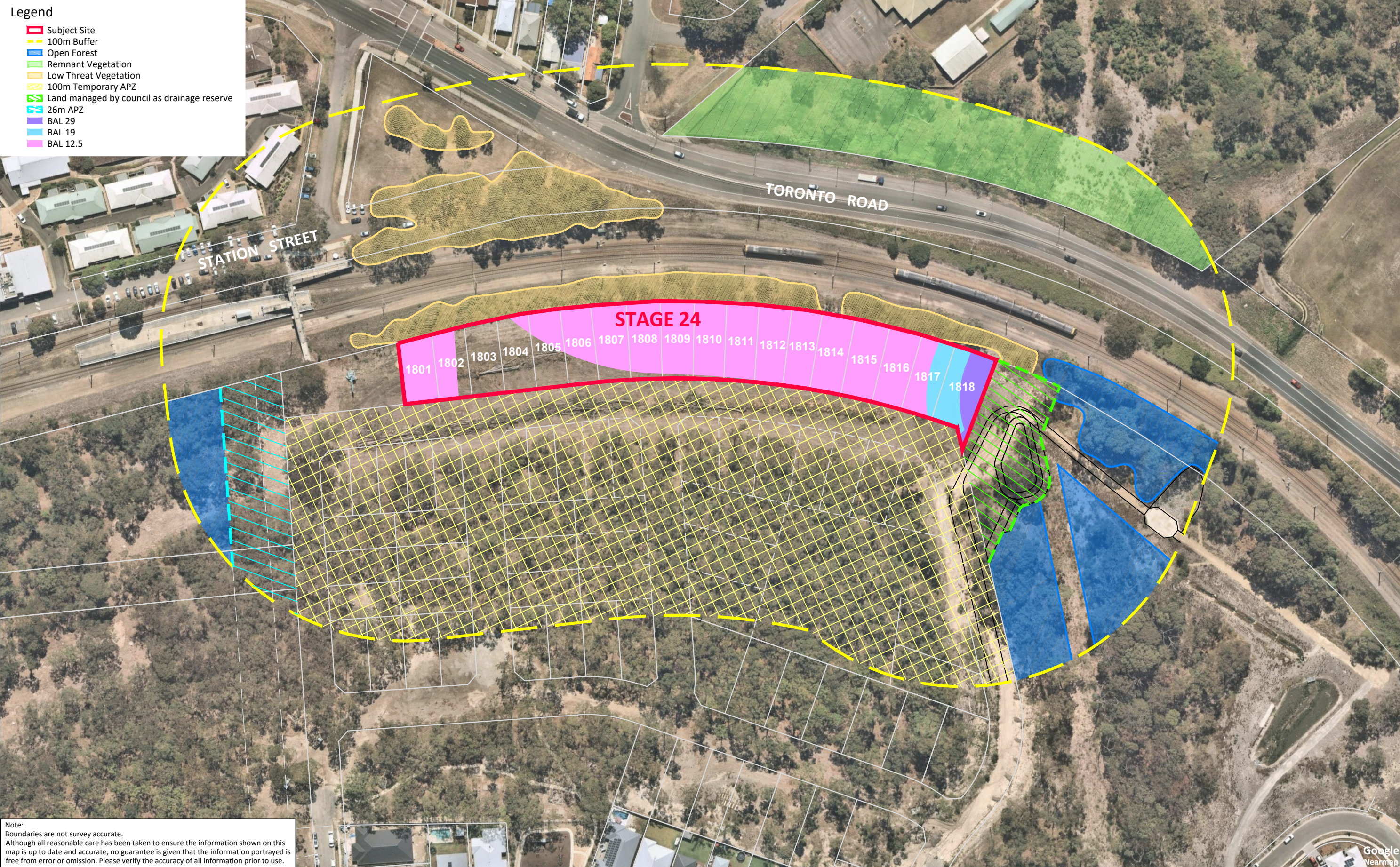
FIGURE 4-1: BUSHFIRE ATTACK LEVELS

CLIENT McCloys Pty Ltd SITE DETAILS Stage 24 Teralba DATE 12 August 2020